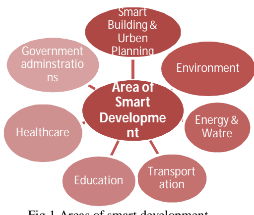
Fig.1 Areas of smart development

Website: <u>www.ijirset.com</u> Vol. 6, Issue 2, February 2017