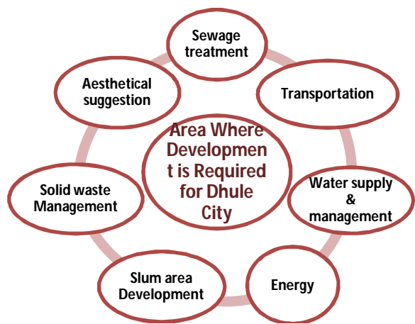
Fig.3 Area where Development is required for Dhule City

Drawing on the conceptual literature on smart cities and the factors outlined above, we have developed an integrative framework to explain the relationships and influences between these factors and smart city initiatives. Each of these factors is important to be considered in assessing the extent of smart city and when examining smart city initiatives. The factors provide a basis for comparing how cities are envisioning their smart initiatives, implementing shared services, and the related challenges.