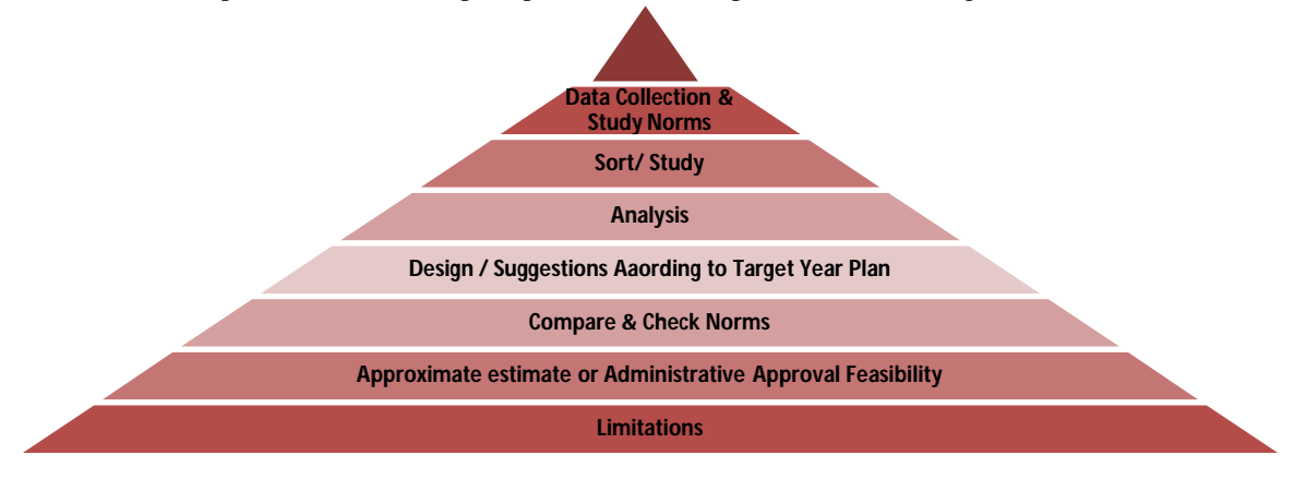
Fig.2 Methodology Diagram

hierarchal levels. The selection of the essential information and criteria was based on the literature, and feedback from questionnaires. To obtain an understanding of the criteria and elements of smart cities, primary data were collected by the various departments through questionnaires and interviews in the field. The survey was based on the perception of road maps, water requirement lacking, and sewage treatment problems after all data collection sorting out various problems, analysis, design & suggestions of various parameters then we find out the most approximate cost or fund required for development of smart city. Hence, the majority of respondents felt that the criteria for the development of smart cities were 'important', while their perception of the same procedures were 'high'.